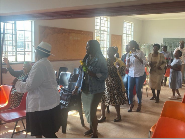
Celebrating during the Sunday service

transfer and then the lead investigator was assassinated. We don't know if his death is related to our property, but the result has been to grind the investigation to a halt, with no clear way forward. Unfortunately, without clarity from the city, the community will not allow us to build. Please pray that our engagements with the city will begin to bear fruit.