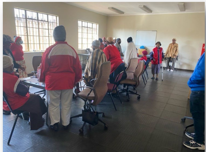
Sharing devotions with the elderly in Pimville

In addition to this, we continue serving the community in doing devotions with the elderly in our community and giving gospel talks to the students in the local high school. We also identify those who are struggling with drug and alcohol addiction and help them to receive the assistance they require. All these various initiatives have had a cumulative effect in entrenching us in the community. We praise the Lord for this!